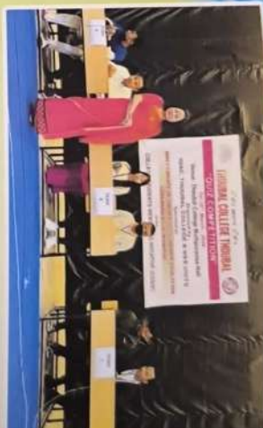
College Quiz Competition, 2024