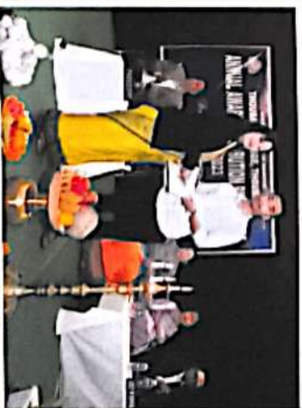
Annual Award Distribution