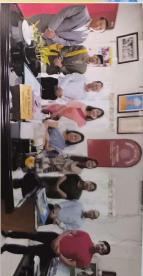
Newly appointed teachers with Principal