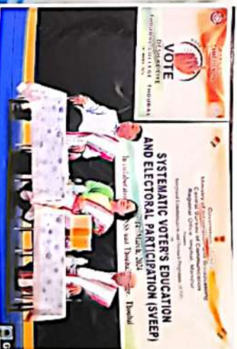
Campaign on MERA PEHLA Vote Desktive