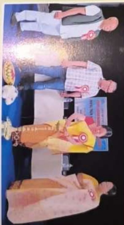
Induction programme, IGNOU