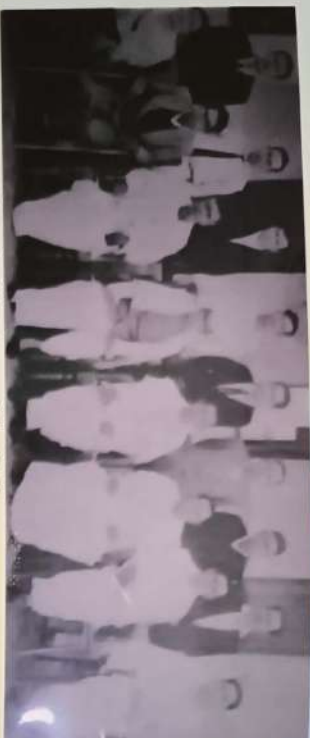
Founder Members of the College