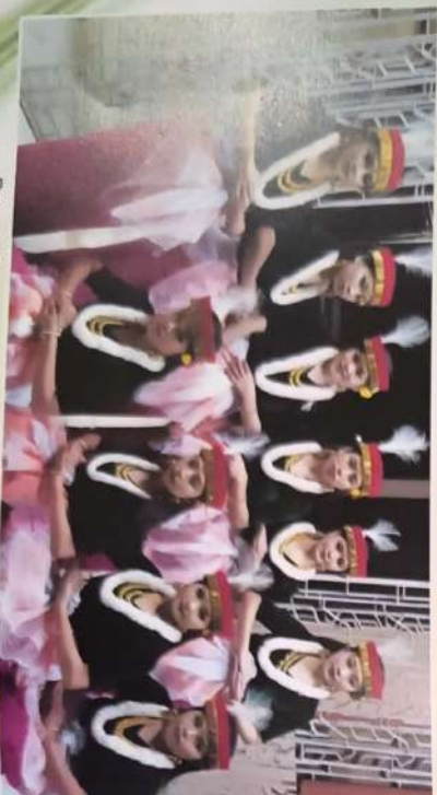
Dance Team to participate MU inter college cultural competition 2023-24