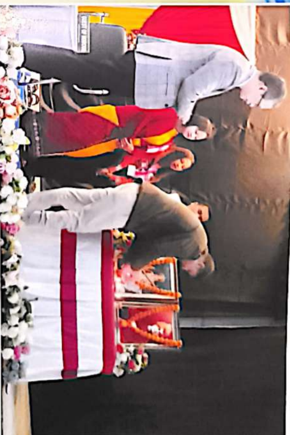
Celebration of National Youth Day 2024