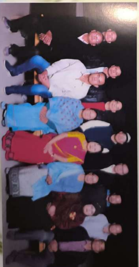
Non Teaching Staff Thoubal College Thoubal