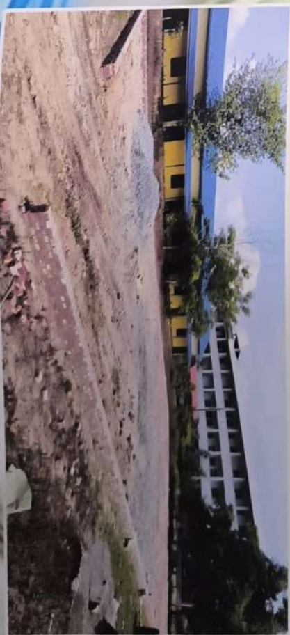
Basketball Ground under construction