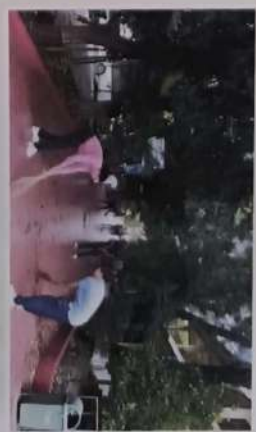
Social Service at College Campus